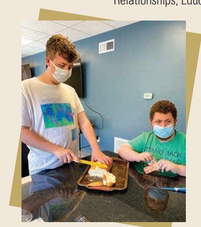
▲ In Lionheart Academy's CREW program, students learn independent living skills like cooking.

Since then, the TowneBank team has worked with Lionheart on refinancing a real estate loan, ultimately cutting down the cost of the loan payment. With the additional funding, Lionheart is launching a new program that provides support to students following graduation. CREW - Character, Relationships, Education, Work Skills - includes independent living skills and