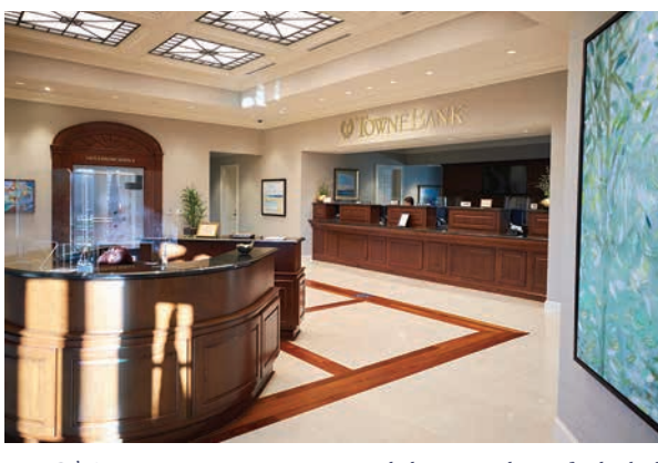
▲ PC&A Business Environments provided interior design for both the Chesterfield location (shown above) and Myers Park Financial Center.

manager for Myers Park. A well-known Charlotte banker, he has more than 25 years of experience, including commercial lending and banking services. He has assembled a great team of local