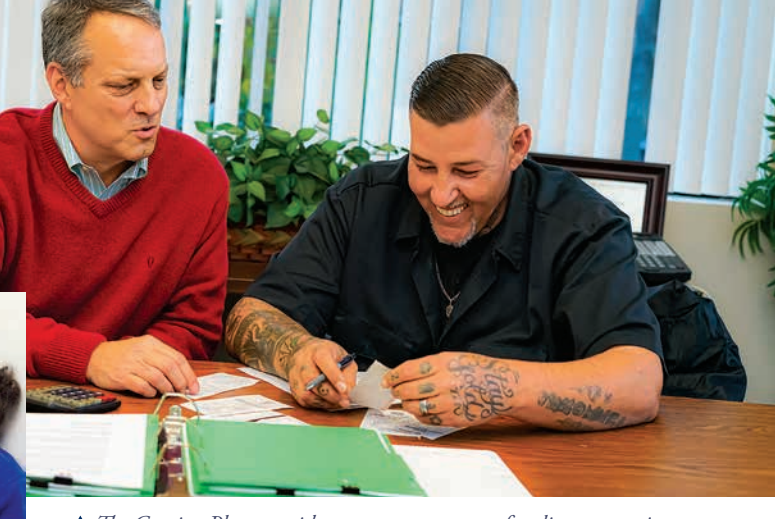
▲ The Carying Place provides one-on-one support for clients on topics like budgeting and career opportunities.

The Carying Place relies on volunteers to accomplish their