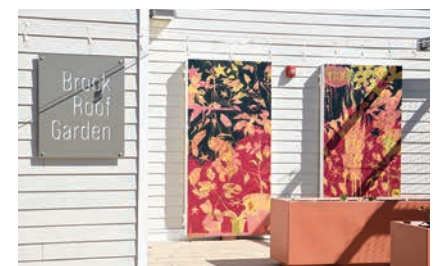
▲ The Brock Roof Garden offers a relaxing space for families while staying at The Landmark Center.

the cities of Chesapeake, Suffolk, Norfolk, Portsmouth, and Virginia Beach to support the campaign. TowneBank is also a lead sponsor for the ForKids Art Auction, which raises more than $1 million each year to provide a pathway out of poverty for families and children right here in Hampton Roads.