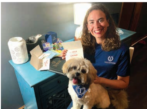
CARDS OF ENCOURAGEMENT