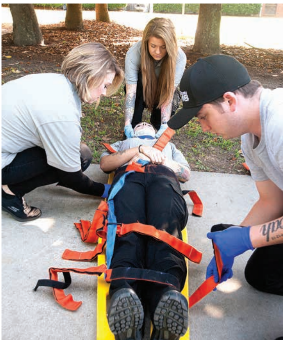
▲ Students practice their skills at the Stanley Griggs EMS Training Center.

Since 1961, the College of the Albemarle (COA) has proudly served the academic needs of the region. The first comprehensive community college in North Carolina, COA continues to expand its programs and services throughout the seven counties in the Albemarle area – Camden, Chowan, Currituck, Dare, Gates, Pasquotank, and Perquimans. Now COA has some exciting news to share with a brand-new, state-of-the-art campus in Manteo and a new EMS Training Center in Currituck.