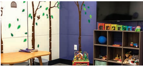
▲ The child therapy playroom at the Steven A. Cohen Military Family Clinic in Virginia Beach.

The clinic opened in August 2019 and offers comprehensive high-quality mental health services accessible to the more than 200,000 post-9/11 veterans and military families in Hampton Roads, regardless of discharge status, length of service, or combat experience. It is part of a nationwide network of clinics first launched in 2016 by Cohen Veterans Network supporting post-9/11