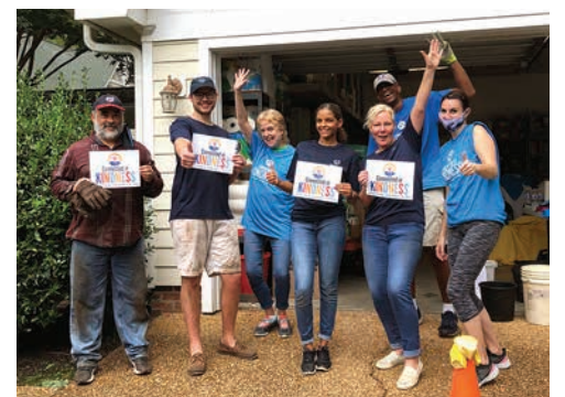
WILLIAMSBURG HOSPICE HOUSE

"By giving, advocating, and volunteering, your contribution to the Day of Caring campaign improves the lives of our neighbors in need, and reminds us all that we are connected in kindness."