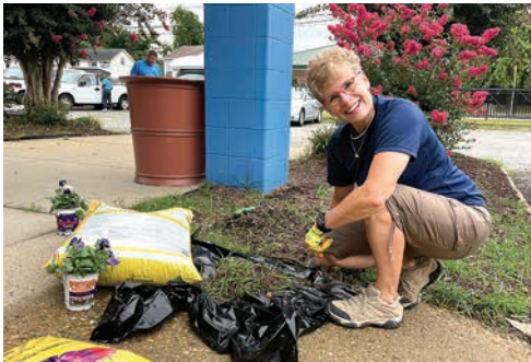
BOYS & GIRLS CLUBS OF THE VIRGINIA PENINSULA