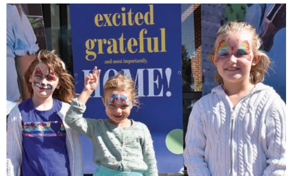
Continued on page 5

The Landmark Center is the final project in the Campaign ForKids, which also funded the Birdsong Center, a regional services center in Suffolk, dedicated in November 2018. TowneBank joined over 300 private donors as well as