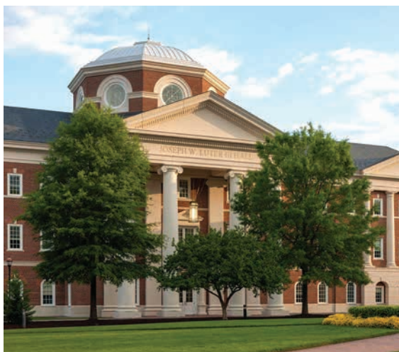
▲ The Joseph W. Luter, III School of Business at Christopher Newport University.