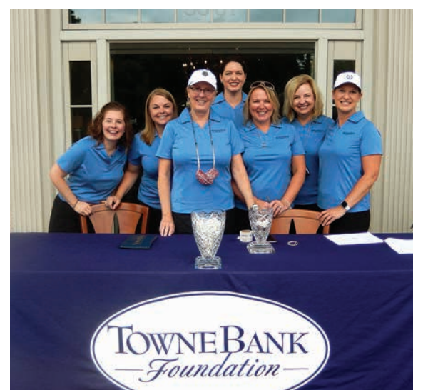
▲ Volunteers are ready to sign in the golfers for a day of golfing and great fellowship.

Thank you to our amazing sponsors, including our presenting sponsor Howard Hanna, for their continued support in our mission to serve others and enrich lives.